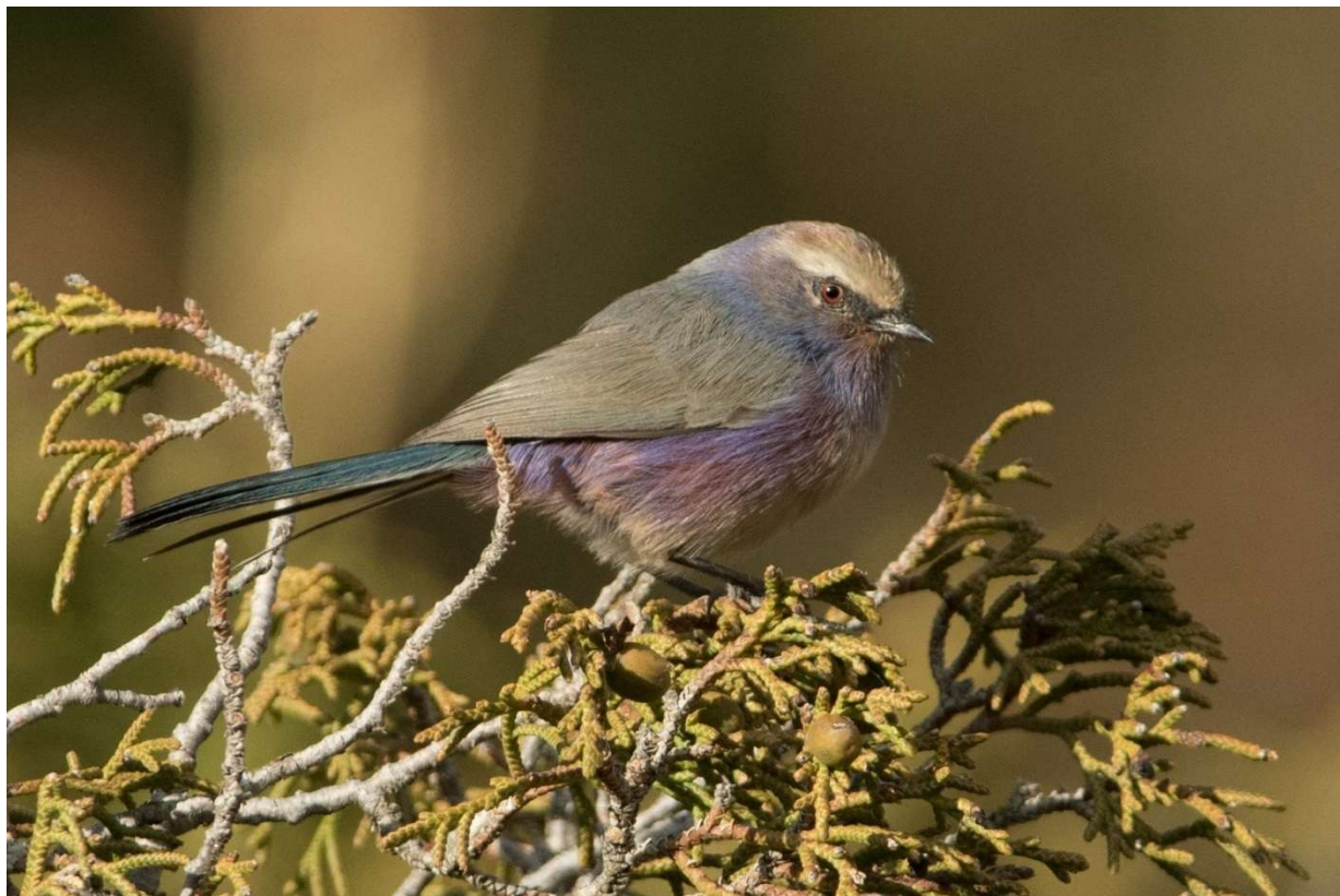
Stunning White-browed Tit-Warblers inhabit junipers in the Tien Shan Mountains

European birders have been enjoying these stable countries and their fantastic birds and history ever since they gained independence after the collapse of the Soviet Union. (VENT operated its first and highly successful tour in 2009.) A combined visit to these destinations is a guaranteed success and an unforgettable experience, and we feel sure that participants will be delighted with extraordinary Central Asia.