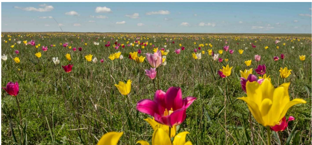
In some years we are lucky to come across steppes full of Schrenk's Tulips.

May 22, Day 21: Korgalzhyn State Nature Reserve. We will depart early this morning for the best birding sites in the Korgalzhyn State Nature Reserve. Despite being three hours from Astana and possessing a collection of birdlife that has recently attracted a nomination for UNESCO World Heritage Site status, the Korgalzhyn area remains surprisingly unknown, even within Kazakhstan. The vast wetland area, a combination of virgin steppe and lakes, is home to wolves, marmots and saiga antelope. With the latter becoming increasingly easier to find in recent years. However, it is the birds that are the real attraction. Located at the crossroads of two migration routes, the wetlands act as a giant motorway junction service station for birds (Lake Tengiz alone has the capacity to feed 15 million birds).