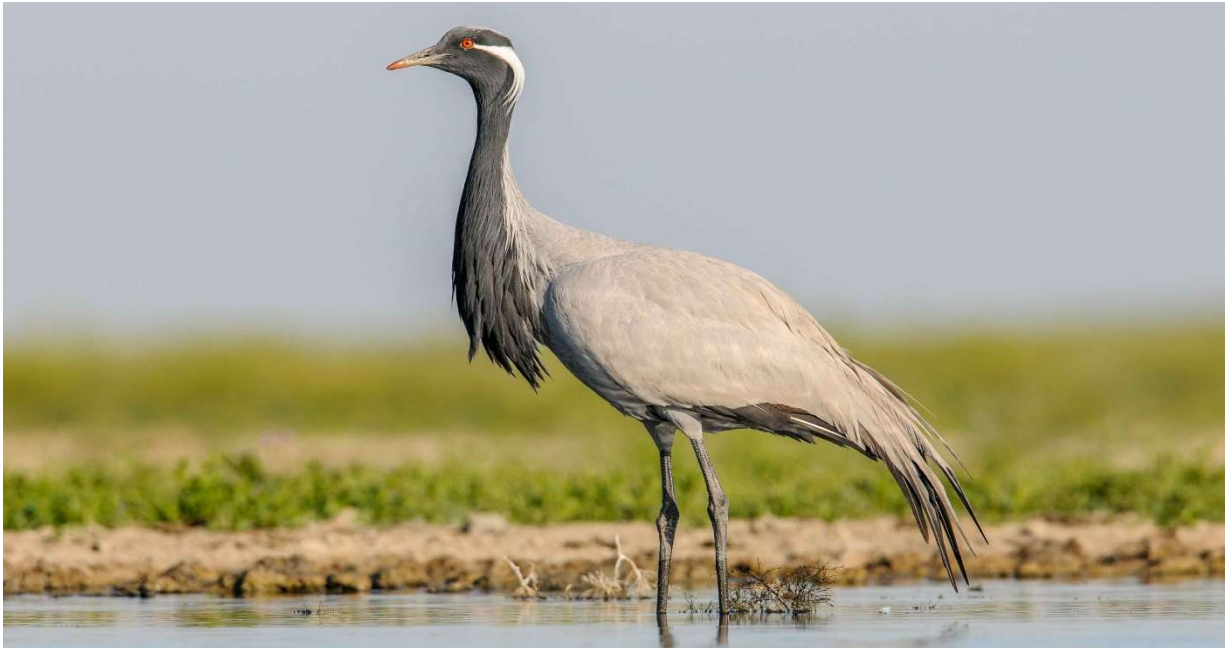
Close views of gorgeous Demoiselle Cranes are almost guaranteed

because of its skulky behaviour and rare existence in this part of Central Asia. In the Kokpek Pass we might come across ten-thousands of Black-veined Whites. These gorgeous butterflies fly in large numbers during the month of May; we only need to be lucky with the correct weather circumstances.