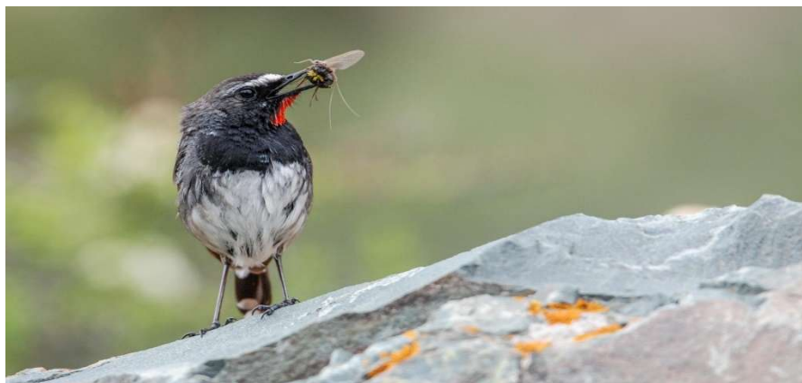
Captivating White-tailed Rubythroats await in the high mountains of the Tien Shan.