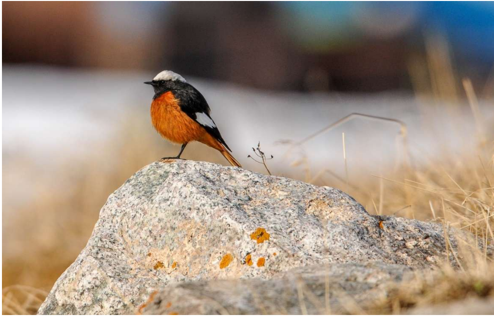
Another high mountain specialist, Güldenstädt's Redstart (White-winged Redstart), with probably the best name of all!

May 17, Day 16: Karakol to Almaty. Birding en-route, we retrace our steps back to Almaty. This is a full transfer day, which we will mostly spend admiring the landscape from the bus. The road is long, mostly unpaved and we'll take several stops to refresh and stretch our legs. A stop in one of the small villages along the road might render Red-rumped Swallows, Indian Golden Oriole, Lesser Gray Shrike, Long-tailed Shrike, Greenish Warbler, and lovely Laughing Doves. We'll arrive at our excellent hotel in Almaty in the late afternoon, where a refreshing shower awaits.