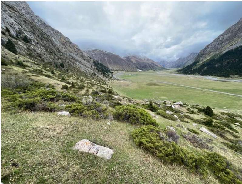
Gorgeous Juniper habitats are home to most of our Himalayan targets.

May 16, Day 15: Barskoon Gorge We have a full day in this glorious high-altitude landscape to find a wonderful array of alpine specialists. Black-throated, Altai and Brown accentors, Sulphur-bellied Warbler, Red-mantled Rosefinch, White-tailed Rubythroat, White-winged Grosbeak and the incomparable White-browed (Severtzov's) Tit-warbler await us! Higher up in the mountains near a gold mine at an altitude of 10,500 feet, we will look for Lammergeier, Himalayan Griffon, Red-billed and Yellow-billed choughs, Plain Mountain-Finches, White-winged (Güldenstädt's) Redstart and the star attraction: Himalayan Snowcock, which we have a good chance to see but always requires some searching. They are best found a little later in the morning, when the first rays of sun start shining down on the rocky slopes of the Tien Shan Mountains. When they start calling, we'll focus to find these giants snowcocks using a Swarovski scope.