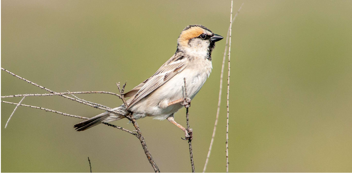
Range-restricted Saxaul Sparrows are found in the rare Populus diversifolia forests near Lake Balkhash

White-winged Woodpecker, Pale-backed Pigeon (Eversmann's or Yellow-eyed Dove) and, if we are especially lucky, Pallid Scops-Owl. The latter, having changing roosts, are very difficult to find during daytime. Along the way we will undoubtedly encounter a myriad of Greater Short-toed, Asian Short-toed and Calandra larks, Isabelline Wheatears and Isabelline (Red-tailed) Shrikes, amongst which we must diligently search for Steppe Gray Shrike. Other possible species along our way include Pied and Desert wheatears, Rock Petronia, Spanish Sparrow, gorgeous little Azure Tits and more Long-legged Buzzards. After dinner we head out for a night excursion in the hopes of finding the cute Common Wonder Gecko; the curious Small five-toed jerboa and the Libyan Jird, found on our 2022 expedition.