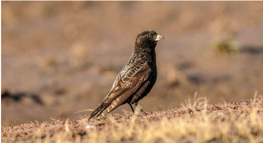
The major highlight of a visit to the northern steppes is the near-endemic Black Lark.

Most of the area is protected as a Zapovednik (national nature reserve) and is home to the world's northernmost population of Greater Flamingos. It also supports over 300 bird species, including one of the largest wildfowl populations in Asia. Other notable residents include pelicans, cranes and a variety of birds of prey.