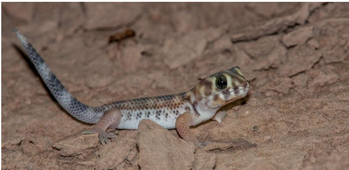
We will explore the area around our private yurt camp in hopes of finding the cute Common Wonder Gecko