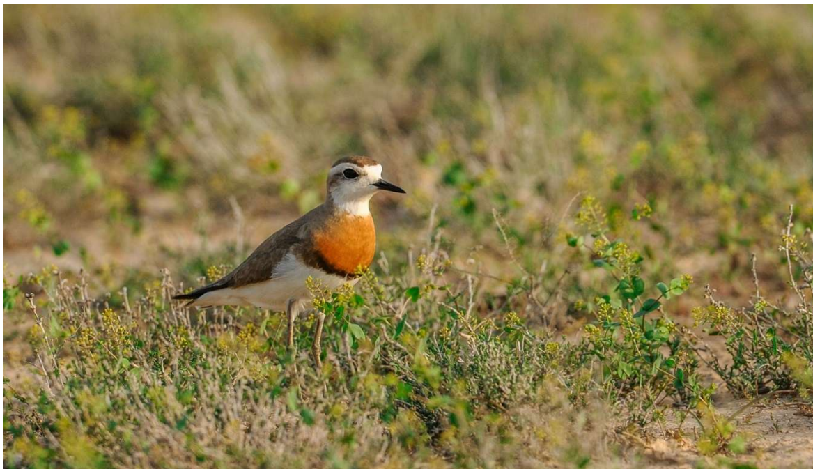
Exquisite Caspian Plovers are found in the Tau-Kum Desert

For a long time, Kazakhstan has been known for its large variety of rare Western Palearctic species and alluring steppe species like Black Lark and White-winged Lark. In Kazakhstan everything is on a vast scale, which is not surprising as it’s the ninth largest country in the world! Great expanses of flat steppe grasslands merge into sandy and stony deserts. Dotted here and there are saline and freshwater lakes which act like magnets to nesting and migrant birds. The bird-life is stunning! Apart from a large list of more typically European species, there is a remarkable list of very special breeding birds largely confined to Central Asia. The most attractive to Western birders are near-mythical species such as the previously mentioned Black and White-winged lark; the critically endangered Sociable Plover; sensational Macqueen’s Bustard; flocks of the secretive and rare Pallas’s Sandgrouse; colorful Caspian Plover; and tiny Asian Desert Warblers singing loudly in the vast plains of Sogety. Visits to the declining Turanga Forest near Balkhash Lake is a certainty for White-winged Woodpeckers, Saxaul Sparrow, Shikra and the very rare Yellow-eyed Pigeon.